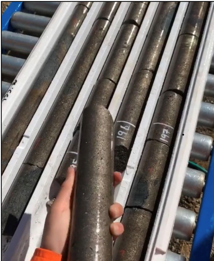
Photo: Core tray of massive sulphides from Savannah North Upper Zone Crown area

The Savannah North Ore Reserve infill drilling commenced in June, with 9,298 drill metres completed in the quarter. The infill drilling program is concentrating on the areas above and below the Savannah North 1381 Level, the first production level to be developed. The balance of the drilling is focused on the Savannah North Upper Zone crown area at the upper limit of the known resources. The drilling to date has generally returned better than expected widths and grades (refer to the Company's ASX announcement of 10 October 2019 for drilling results and JORC (2012 Edition) Disclosure Tables).